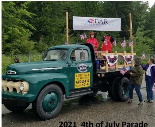
2021 4th of July Parade

July 4th Parade in Bridgton. Come be a spectator and cheer on the DAR members as they ride in our vintage 1953 flatbed truck. Featured this year will be