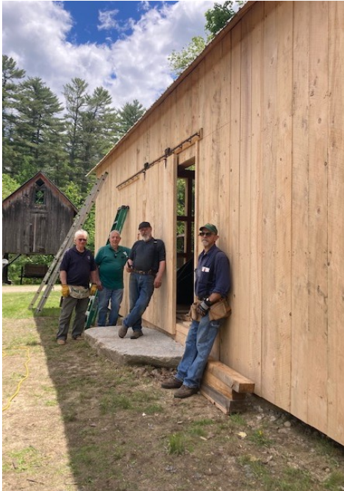
Top left: Crew who helped stand the shed. Top right: Putting the roof sheathing on. On the right: Installing the metal roof. On the left: Good days work with the siding in place and door on.

Thanks to the Davis Family Foundation, the Brook Family Foundation, the Narragansett Number One Foundation, & the Norway Savings Bank for their financial support to make this project possible, also to all the volunteers (too many to name) and our contractor Ed Somers Woodworking. Now to create the old machinery exhibit related to the early mill.